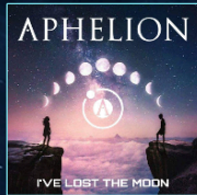
"I'VE LOST THE MOON" SINGLE - 2020