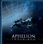
"TRAVELERS" SINGLE - 2025